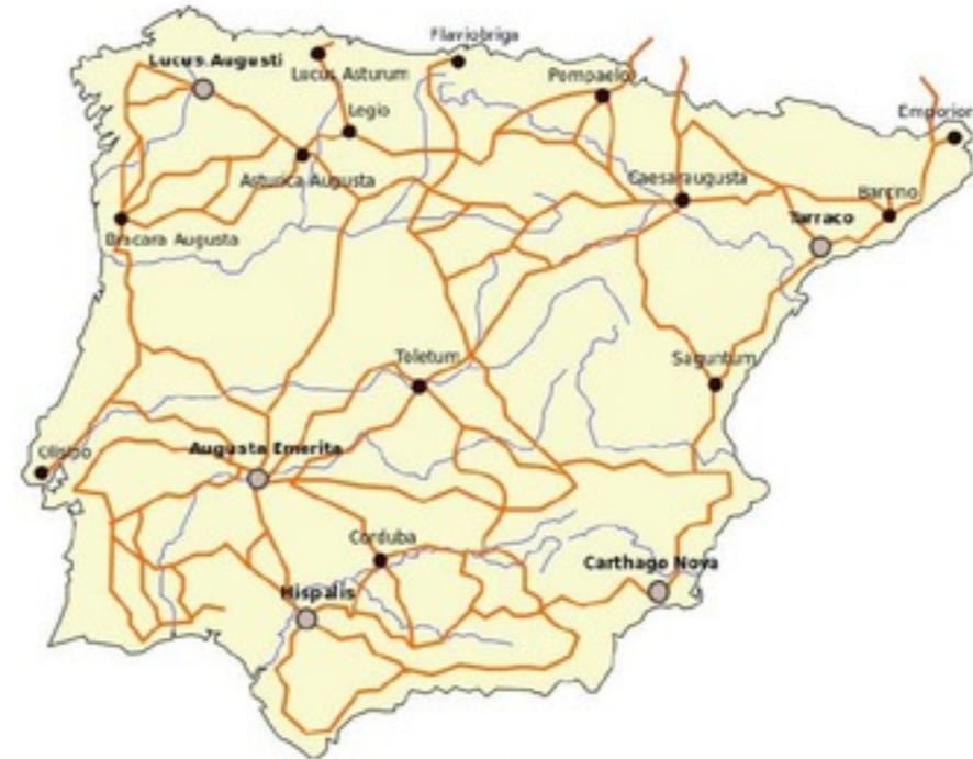
Map of major Roman roads in modern-day Spain and Portugal.