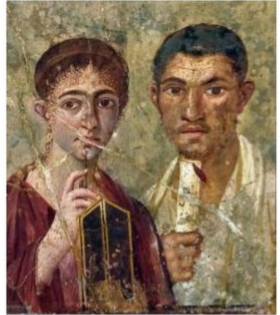
Fresco of a couple in Pompeii, Italy holding a writing tablet and a scroll, ca. 20-30 CE.

Marcus Tullius Cicero (106 BCE- 43 BCE) was a Roman statesman, lawyer, scholar, and writer who vainly tried to uphold republican principles in the final civil wars that destroyed the Roman Republic. His writings include books of rhetoric, speeches, philosophical and political treatises, and letters.