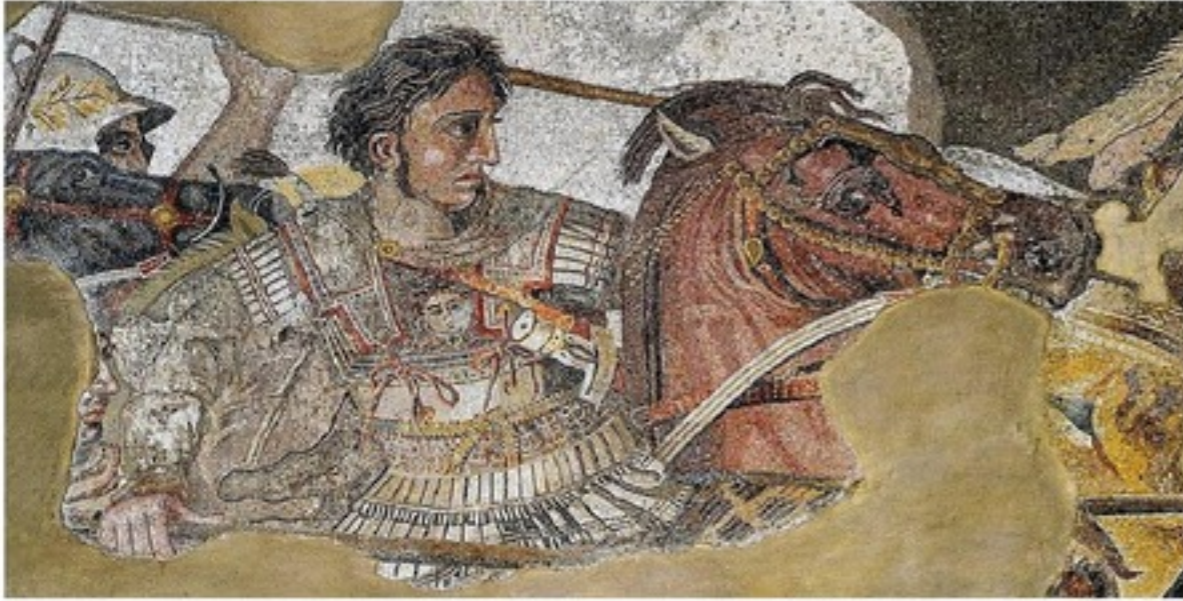
A section of the Alexander Mosaic, a much larger Roman work depicting a battle involving the Greek general Alexander the Great created in Pompeii around 100 BCE