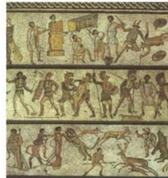
Mosaic showing musicians and battles between people and animals that took place in arenas like the Colosseum.