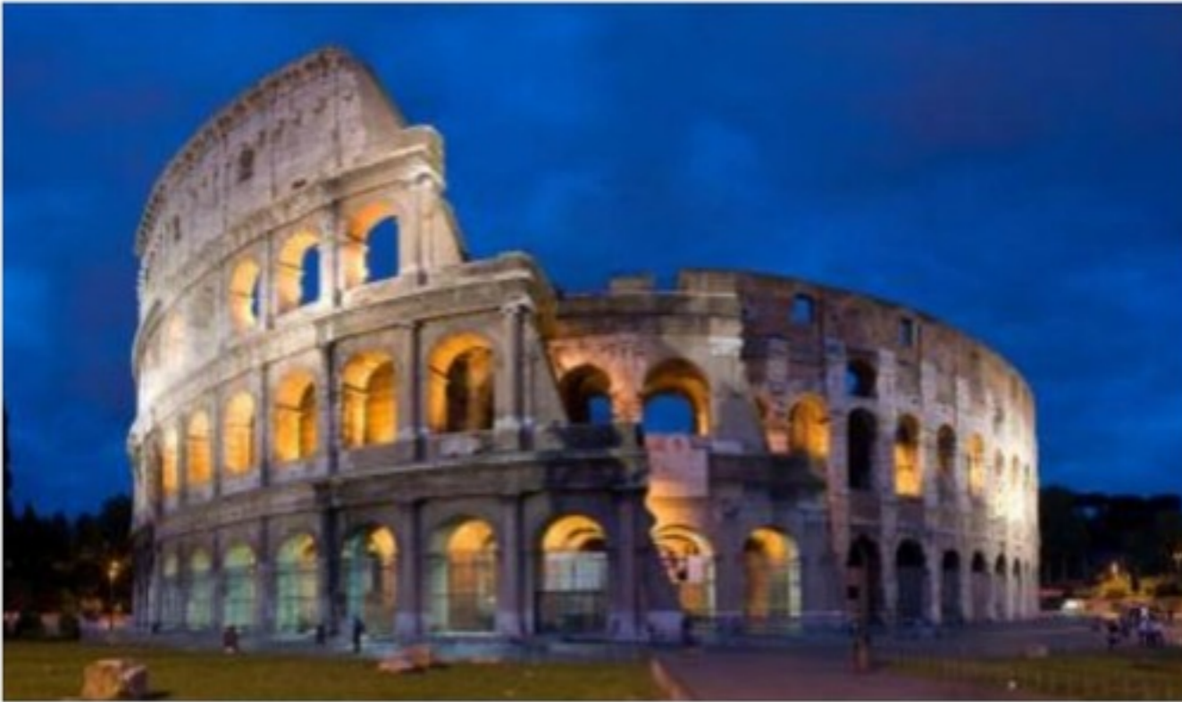
The Colosseum, Rome.

Watch Deconstructing the Colosseum and an excerpt of Where did it come from? Ancient Rome's Stadiums , read the text, and examine the image below.