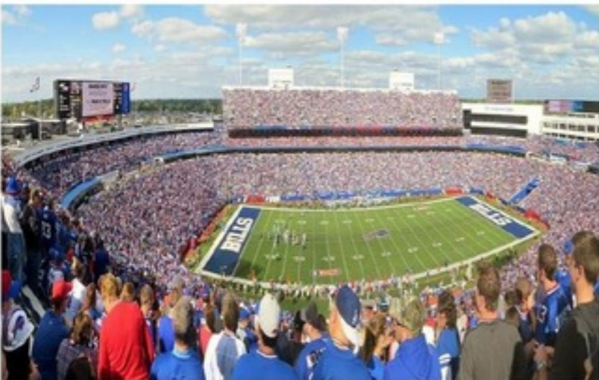
New Era Stadium, where the Buffalo Bills American football team plays.

Source: "Roman Architecture." Ancient History Encyclopedia. http://www.ancient.eu/Roman_Architecture/