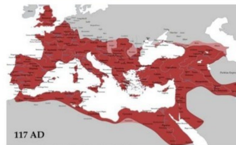
The Roman Empire at its height, during Pax Romana.