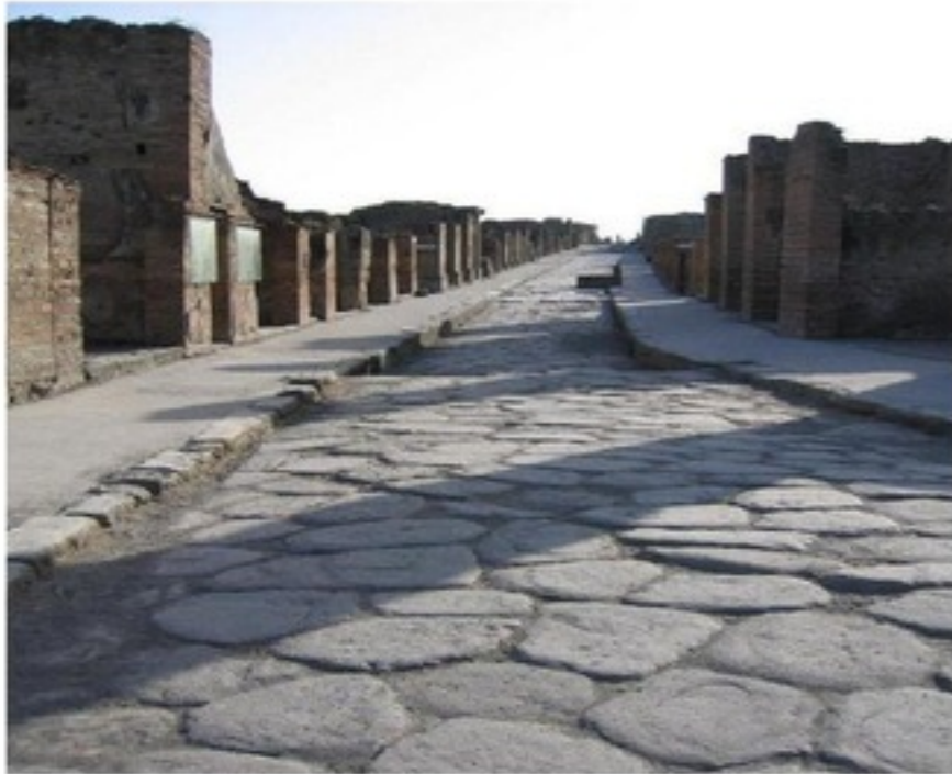
A street in Pompeii.

Watch Ancient Roman Superhighway , an excerpt from Where did it Come From? Ancient Rome , and an excerpt of Mankind: The Story of All of Us about Roman roads and examine the images below.