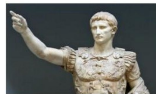
Statue of Augustus, 1st Century CE.

The empire strengthened its central government, consolidated its power, and created a stable condition in which trade and communication flourished. The empire protected and governed individual provinces, permitting each to make and administer its own laws while accepting Roman taxation and military control . Through state sponsorship, Romans made great achievements in architecture, engineering, and the arts.