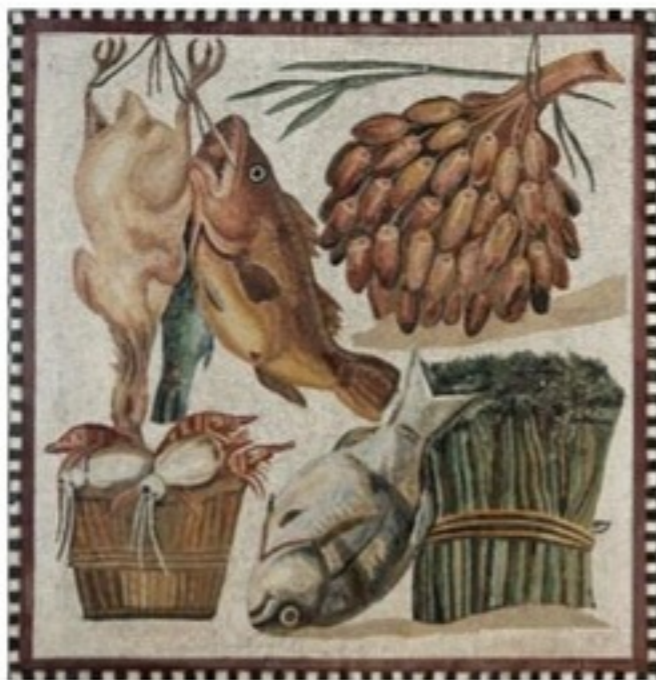
A Roman mosaic depicting fish and vegetables hanging up in a cupboard, 2nd century CE.