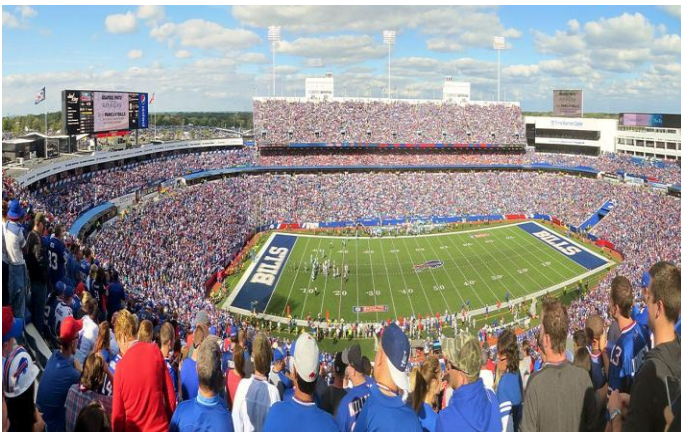
New Era Stadium, where the Buffalo Bills American football team plays.

Many modern day stadiums use similar architecture techniques that were used during the construction of the Colosseum.