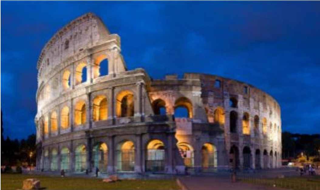
The Colosseum, Rome.

Watch Deconstructing the Colosseum and an excerpt of Where did it come from? Ancient Rome's Stadiums , read the text, and examine the image below.