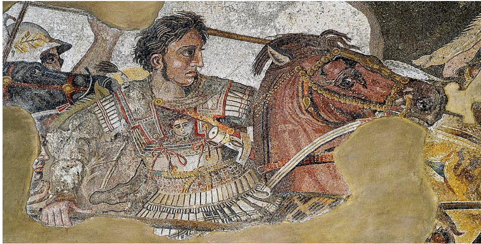
A section of the Alexander Mosaic, a much larger Roman work depicting a battle involving the Greek general Alexander the Great created in Pompeii around 100 BCE