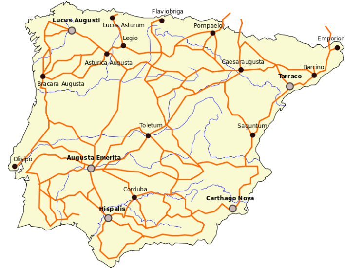
Map of major Roman roads in modern-day Spain and Portugal.