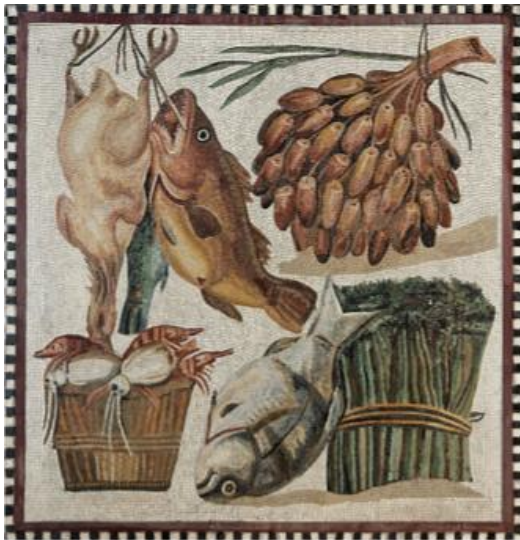
A Roman mosaic depicting fish and vegetables hanging up in a cupboard, 2nd century CE.