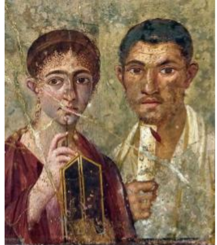
Fresco of a couple in Pompeii, Italy holding a writing tablet and a scroll, ca. 20-30 CE.

Marcus Tullius Cicero (106 BCE- 43 BCE) was a Roman statesman, lawyer, scholar, and writer who vainly tried to uphold republican principles in the final civil wars that destroyed the Roman Republic. His writings include books of rhetoric, speeches, philosophical and political treatises, and letters.