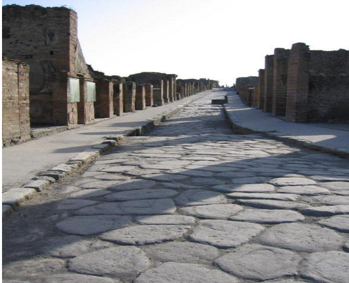
A street in Pompeii.

Watch Ancient Roman Superhighway , an excerpt from Where did it Come From? Ancient Rome , and an excerpt of Mankind: The Story of All of Us about Roman roads and examine the images below.